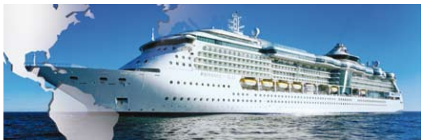
Easy electronic procurement of OEM spare parts from Aalborg Industries

Aalborg Industries began using ShipServ's trade system five years ago. In the past two years we have seen a rapid increase in transaction volume, and together with the general development in e-procurement, this led to the decision to make the integration of our spare parts sales system with ShipServ's TradeNet.