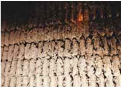
Cleaning of heating surface highly overdue.

Spray nozzles mounted on fixed pipes ensure efficient cleaning of the heating surface. Installed at the economizer's top, the system flushes away any soot deposits that may litter the tube bank.