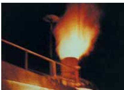
Soot fire raging from the stack.

The problem has prompted some classification societies - like Norway's Det Norske Veritas - to add further requirements to their rules for boiler/economizer installations on new ships. Such measures are expected to contribute to