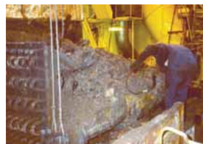
Melt down as a result of soot fire.

a more active involvement of boiler-makers, ship designers, shipbuilders and shipowners towards increasing safety onboard.