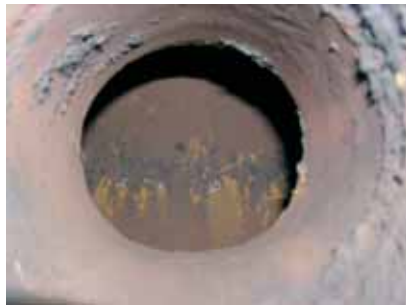
Severe pitting and scaling in downcomer tube

A multi-chemical treatment method should be adopted with an AWT system, and the system should incorporate an oxygen probe for measuring and controlling the amount of dissolved oxygen in the boiler water. Aalborg Industries anticipates increasing adoption of AWT systems driven - despite installation costs - by the short-term and long-term benefits to operators.