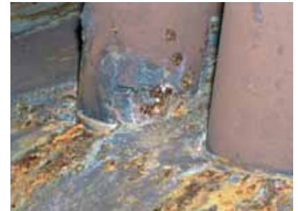
Corroded boiler furnace dome and convection tubes

water treatment system incorporating an oxygen-binding component which can be controlled separately, based on the analysis of remaining dissolved oxygen or the amount of component in excess. The multi-chemical treatment system has the further merit of better individual control with reduced chemical usage.