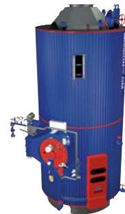
MISSION™ OM for capacities up to 45 t/h

A similar solution but with a higher capacity was chosen by Vanguard SPC Ltd in Australia for their "Woollybutt FPSO". Two MISSION™ OM boilers, each with a capacity of 38.5 t/h, will be placed on deck. The combustion system is designed for gas and hazardous crude with diesel as back-up.