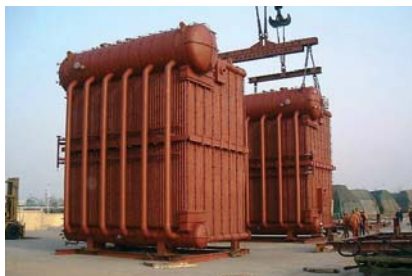
The D-type boilers ready for delivery

One of the orders was signed with Nortrans Offshore - today Prosafe Production - one of the leading players in the market. The client placed an order for two large MISSION™ D-type boilers for their "Espoir FPSO".