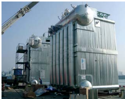
MISSION™ D-type boilers

MISSION D-type is a compact and very sturdy boiler designed for rough seas and high g-forces and is manufactured with the best techniques available today. Thanks to the extended surface in the convection part, the boiler gets compact but still with a larger furnace compared to other boilers of similar type. The result is a low level of thermal stresses and a long life.